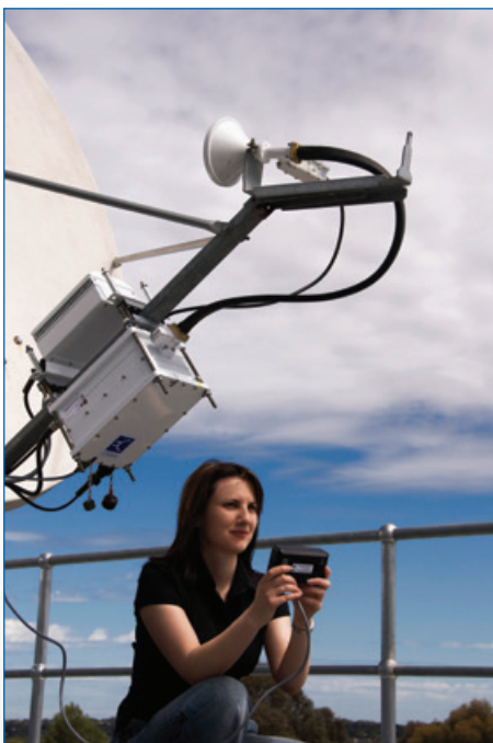
7580 SMPS and 7940 Ku-Band RBUC boom-mounted

CPI offers a range of PSUs for its C-Band 4700/6700/7700 series and Ku-Band 4900/6900/7900 series BUCs and accessories. These PSUs provide power and mounting options to suit most system requirements.