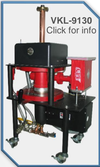
ASTeC, Triumf, HZB