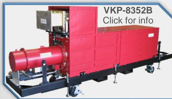
CERN, ESS Bilbao; similar products at IHEP & Tsinghua Univ