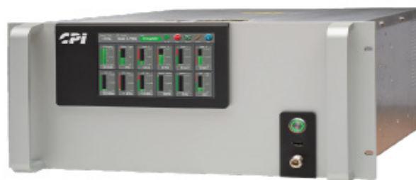
CPI 1250 W Ku-band TouchPower TWTA, Model T5UI-12

Provides 1250 watts of peak power in a 5 rack unit package, digital ready, for wideband satellite service within the Ku-band frequency range.