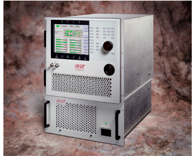
CPI 500 W M-band TWTAs, Model VZSC2780C2

Backed by over 40 years of satellite communications experience, and CPI's worldwide 24-hour customer support network that includes more than 20 regional factory service centers.