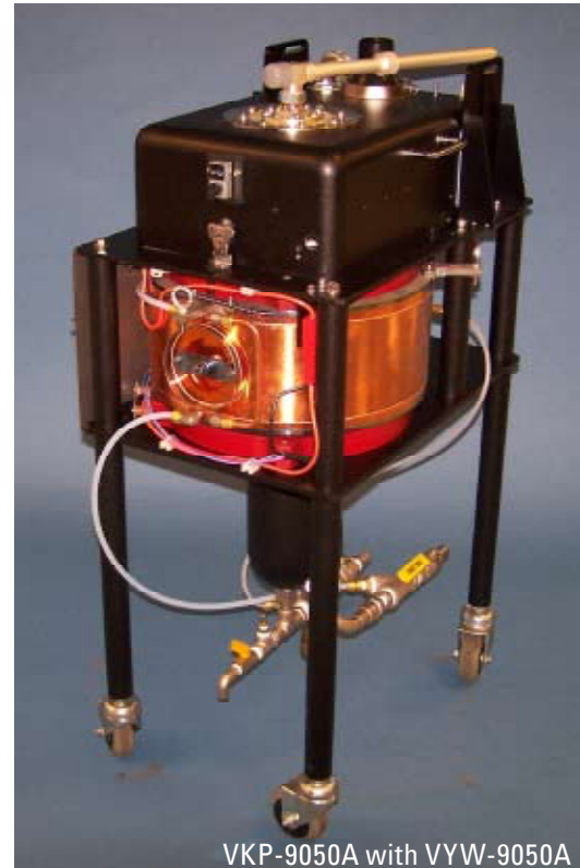
VKP-9050A with VYW-9050A